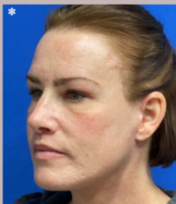
Before & 6 weeks After*