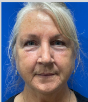
Before & 6 weeks After*